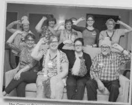
The Crew at Schmitt Woodland Hills are always "Thinking Local"

Address: 2496 U.S. Hwy 14, 1400 W. Seminary St. Richland Center Phone: 608-647-8931